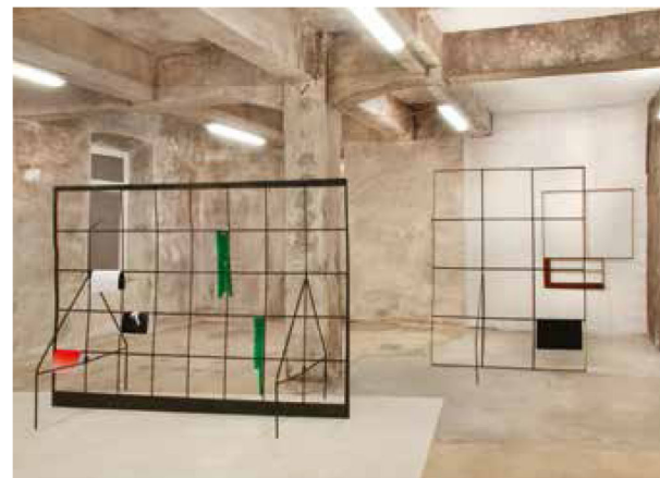
OBJECT ORIENTED OBJECTS